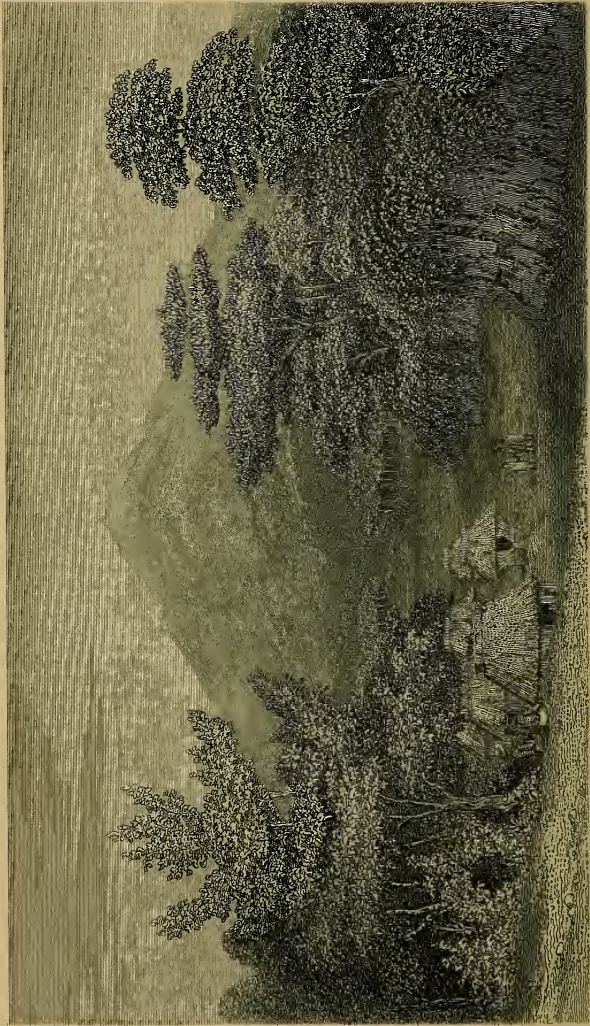
Illustration of a Village